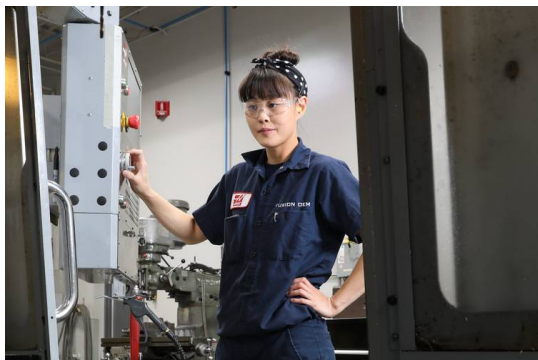
A Fusion OEM employee

She has been forced to delay purchases of new vehicles and tools for the 23-person contracting firm, which specializes in fire and water damage cleanup and restoration. “We are making do with what we have,” she said.